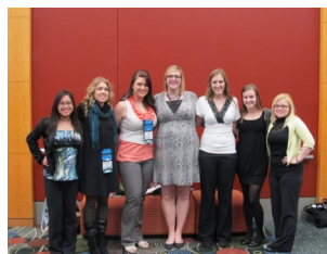
MSNA Executive Board at the 2011 NSNA Annual Convention in Salt Lake City,

expand their local SNA chapters. We were pleased with the turnout and hope many of your attend next year as well!