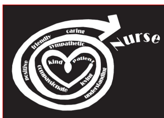
2012 MSNA Convention "Heart of Nursing"

University of Wisconsin, her Masters from University of Alabama at Birmingham in Cardiovascular Nursing and